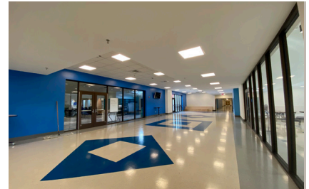
Above: Town Square.