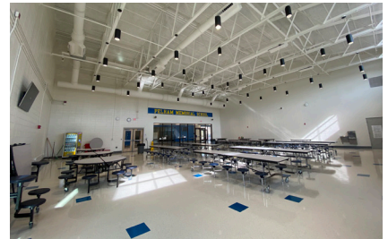
Above: New cafeteria.