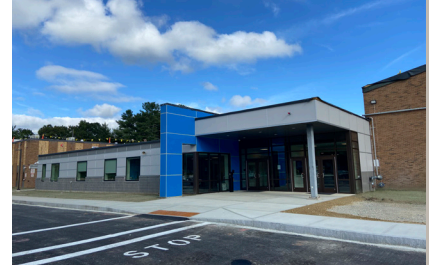
Above: Main entrance progress.