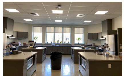
Above: New FACS.